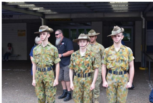
Two of our Team 5 students attending the Anzac Day Assembly.