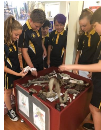
7.5.1 enjoying the Geography excursion to Maitland Bay.