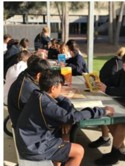
Our targeted sports class - leading the 2018 BWSC class Premier's Reading Challenge

The 2018 Premier's Reading Challenge is in full swing at our campus with only 15 weeks left for students to complete their reading logs. We currently have 498 students registered for this year's challenge, and 49 of these students have already finished. Not that it is a competition, however, our 771 Boys targeted sports look set to finish ahead of any other class this year! It is no surprise that these boys are also the class borrowing the most books per student on average.