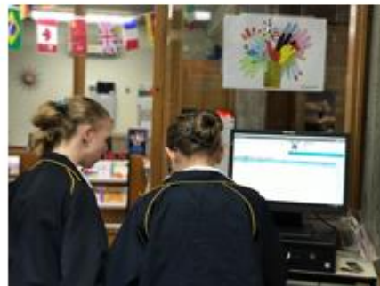
Two of our Student Librarians working at the circulation desk.

One of our recent library displays celebrated Time!