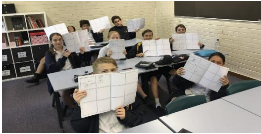
7.2.1 in English completing their Graphic Novels