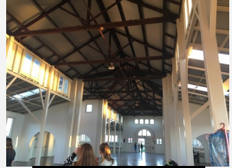
Inside view of our accommodation