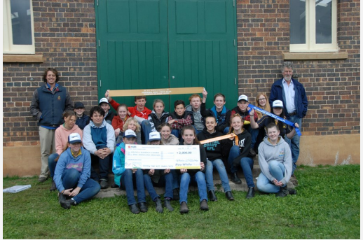
2016 Premier Beef Fest show team