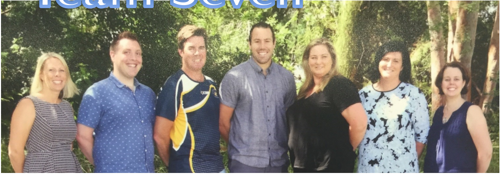
Team 7– Pictured Left to right