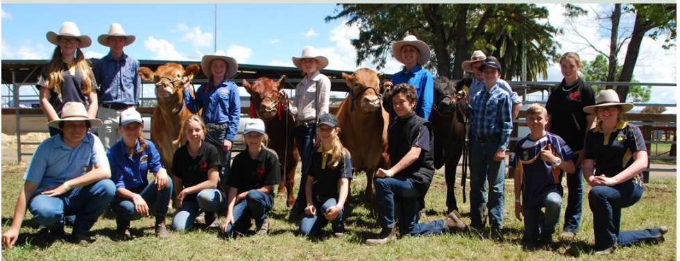
Some of the BWSC Show Team at the Upper Hunter Beef Bonanza

BWSC Agriculture Department would like to acknowledge the generous support from breeders, Umina and Woy Woy Rotary Clubs, Campbells Building Supplies and GL Jackson Real Estate who have enabled the school to provide students with a balanced and comprehensive agriculture education. They have also been instrumental in providing opportunities for our students to learn, not only excellent skills in cattle training and preparation, but team work, accountability, responsibility and work ethic. This continues to provide a solid platform for many graduates to enter successful agricultural tertiary training and employment over the years. These students would otherwise never encounter the diversity of the agricultural opportunities available in Australia. There are currently at least two positions for every Agriculture University and College graduate in the industry.